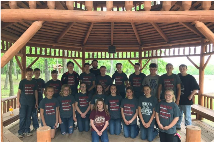
STUDENT LEADERSHIP EWING NORTHERN SCHOOL CAMP