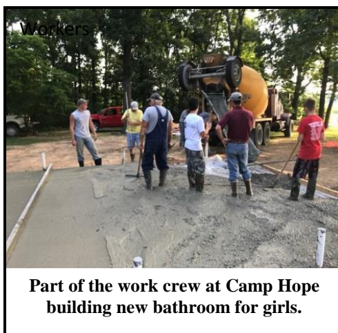
Part of the work crew at Camp Hope building new bathroom for girls.

I cannot pay you enough or thank you enough for all you do. Keep up the great work!