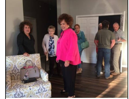
Members and friends visit in the lobby at our new church

What a challenging time everyone has experienced. We are thankful that God is in control. That keeps us on the bright side of everything that has changed. How special it is to realize how thankful we are for our church's friends and family.